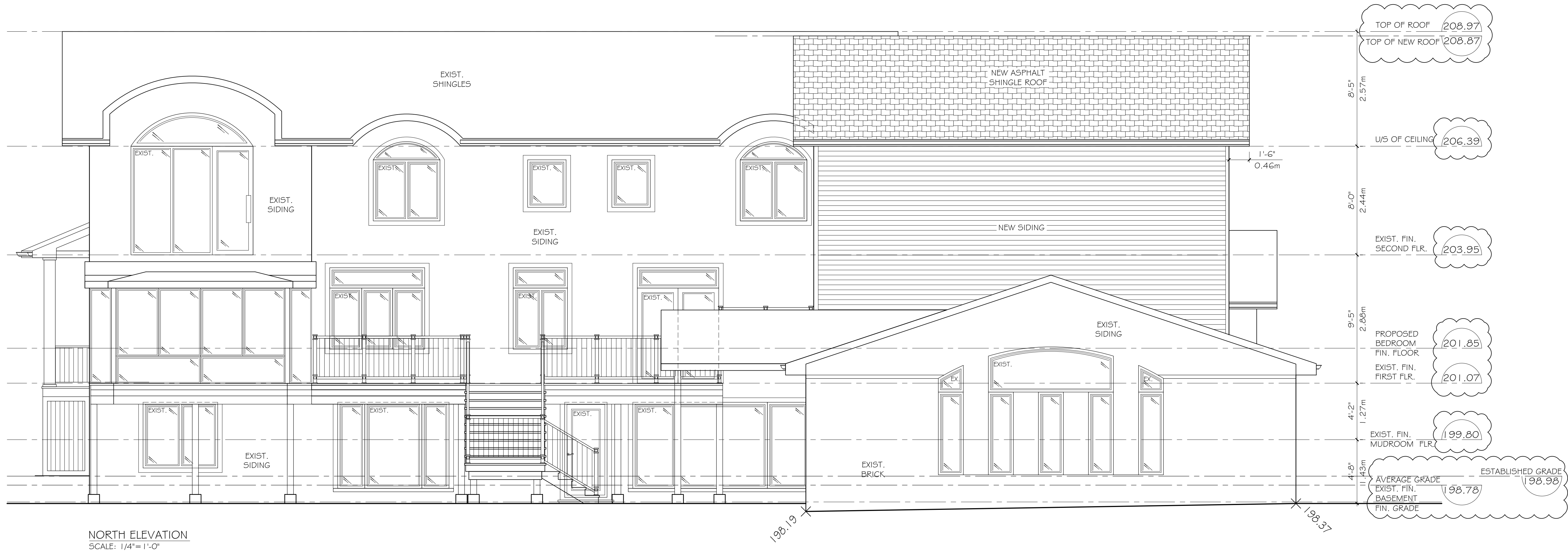
NORTH ELEVATION SCALE: 1/4"=1'-0"